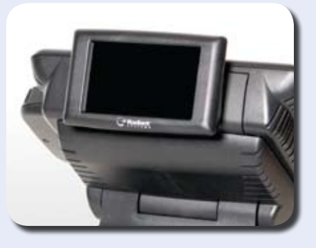
Optional C700 Customer-Facing Order Confirmation Display